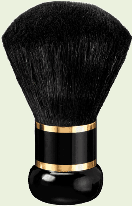
Neck Brush – or Table Brush