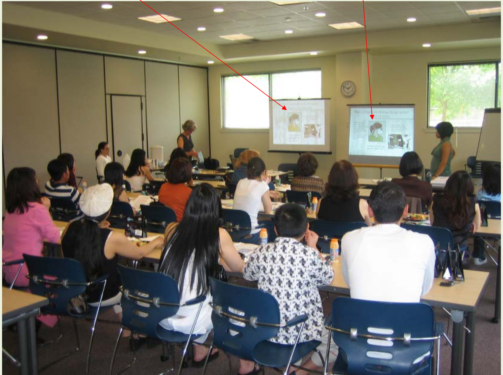
English-Vietnamese Language Workshop for Nail Salon