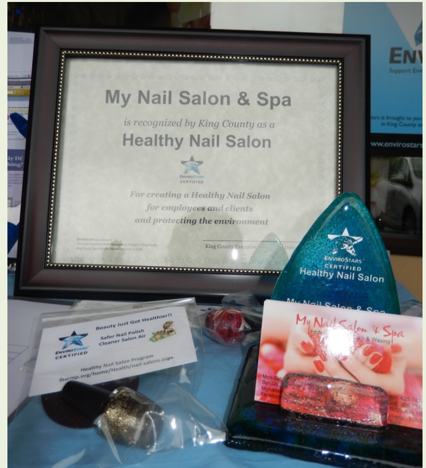
Certificate & Award