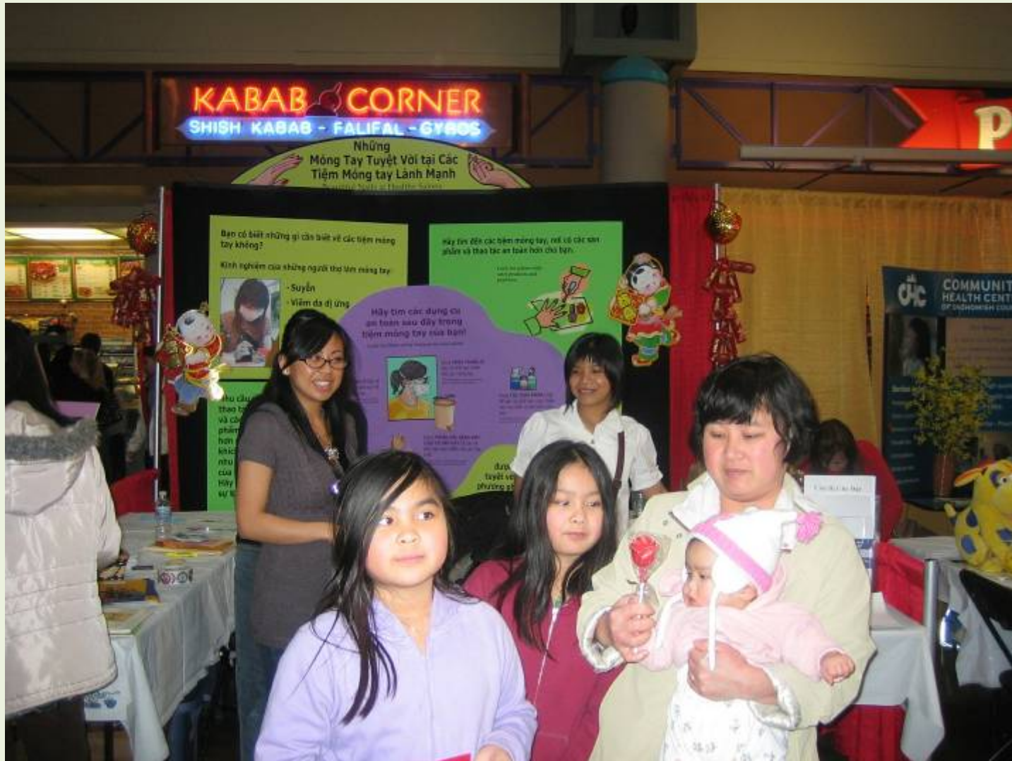
Vietnamese New Year (Tet)